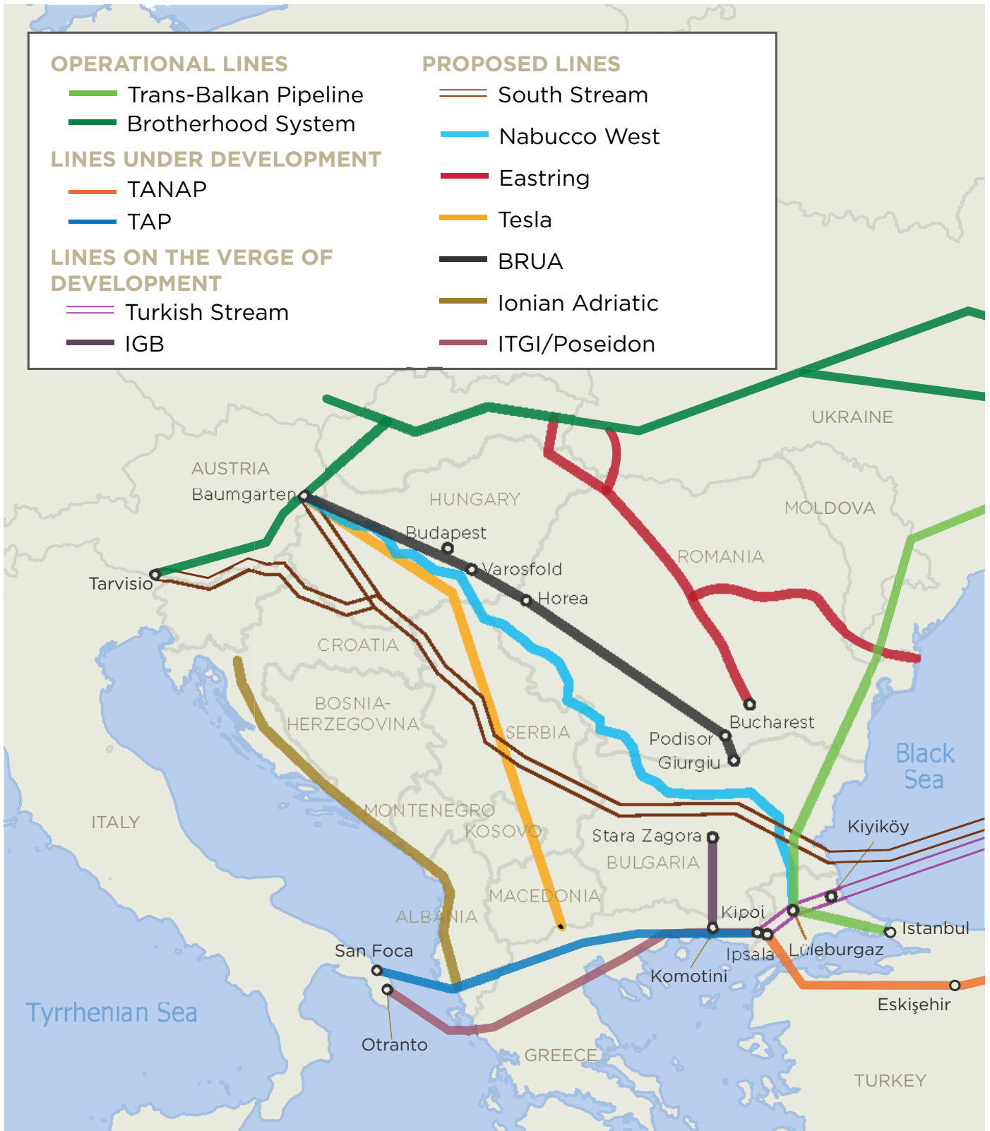
Map 1. Existing, Planned, or Proposed Long-distance Pipelines in Southeastern Europe