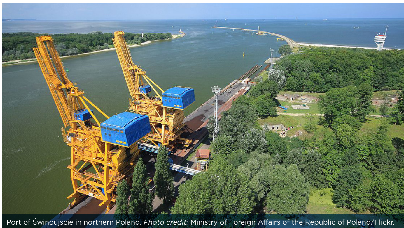
Port of Świnoujście in northern Poland.

This would be enough to secure the immediate requirements of both Hungary and Slovakia. In order to ensure that Ukraine is also able to receive gas, however, the continued reversal of the Brotherhood system—which already allows for gas to flow from Germany to Czech Republic and onwards to Slovakia—is required, with gas able to flow eastwards across the whole of Slovakia and into Ukraine. At present, the Slovakian authorities remain content to transit gas (usually Russian-origin molecules) from points further west by means of the previously disused 14.6 bcm/y capacity pipeline between Vojany in Slovakia and Uzhhorod in Ukraine, which was reopened in August 2014. This ensures that Ukraine currently possesses at least the theoretical capacity to import some 22.2 bcm/y of gas from points further west, as a result of the installation in April 2013 of 6.1 bcm/y of reverse flow capacity on the line between Beregdanic in Hungary and Beregovo in Ukraine and of some 1.5 bcm/y of reverse flow capacity secured in November 2012 on the line connecting Hermenowice (on the Polish-Ukrainian border) with the Ukrainian city of Lviv.