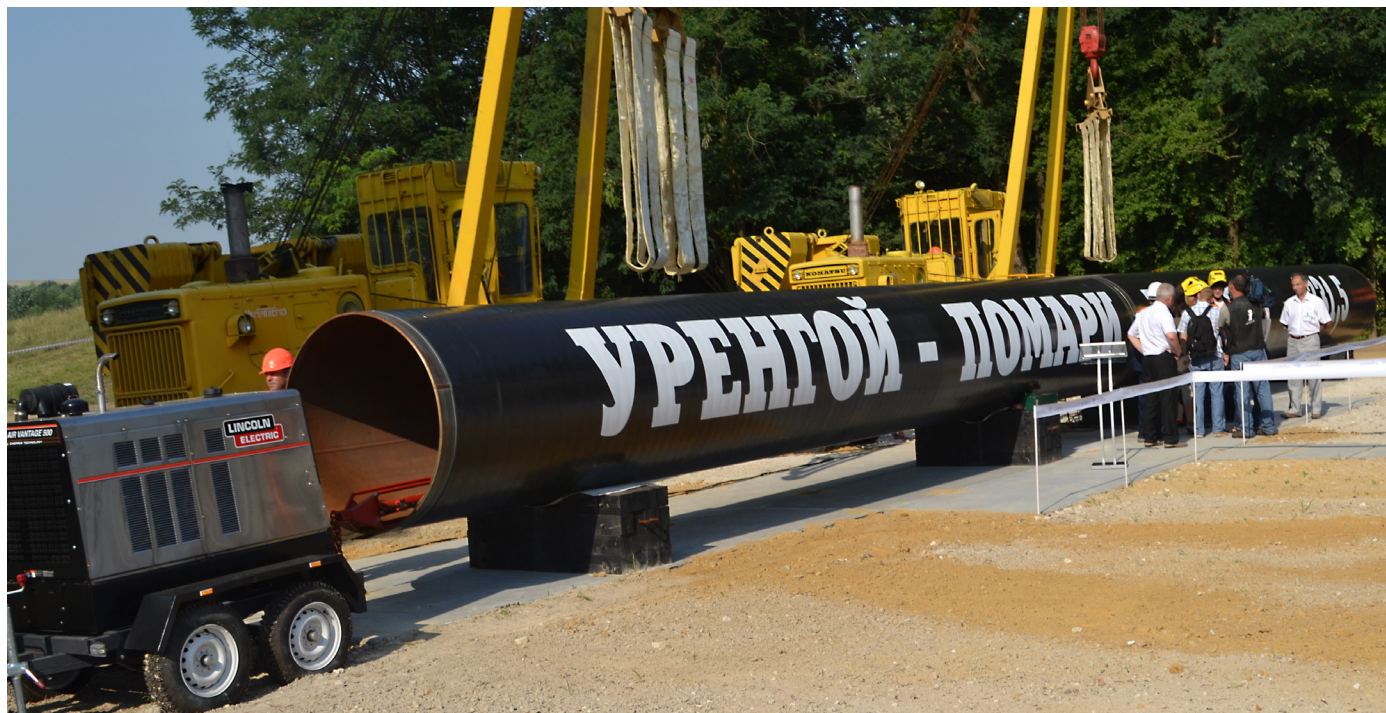
The Urengoy-Pomary-Uzhgorod pipeline, connecting Russia and the European Union via Ukraine, was modernized starting 2011.

years. While it does now look as if Croatia may be able to receive LNG as early as 2018, this is because the focus has switched from a permanent onshore facility to a floating regasification and storage unit (FRSU) along the lines chosen by Lithuania at Klaipėda. Although pressure from the European Commission makes it likely that the FRSU project will now go ahead, there are still concerns that the regulatory side of transit from Croatia to Hungary still needs to be sorted out.